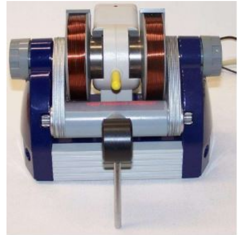
Base unit with glycerine sample inserted