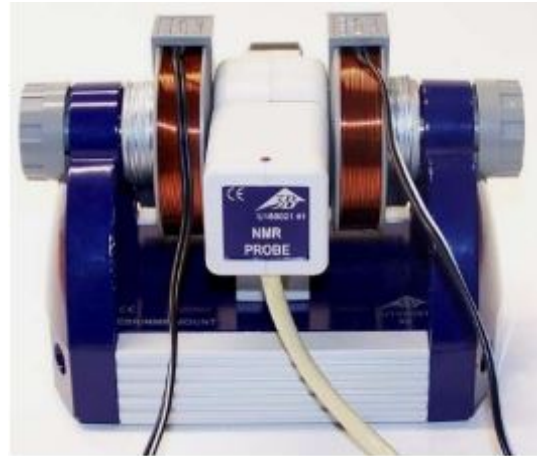
Base with coils and NMR probe