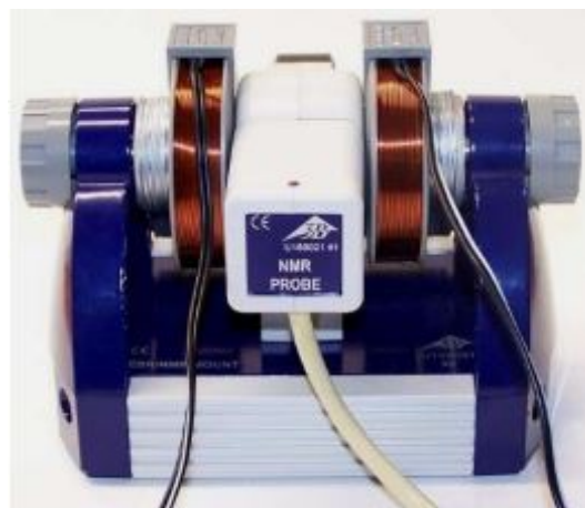
Base with coils and NMR probe