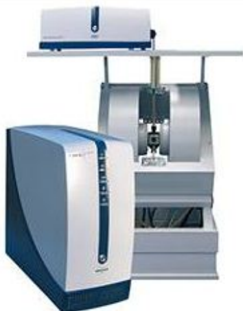
Continuous wave spectrometer (CW-ESR)

Electron spin resonance (ESR) spectroscopy is used in various branches of science, such as in medicine, biology, pharmacy, cosmetology, and biotechnology. It is the method of examination of free radicals in the solid, liquid, or gaseous state, and in paramagnetic centers.