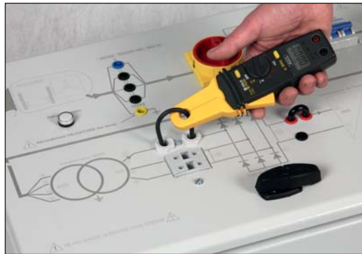
ref. CONVERTYS ref. CHARGEOL