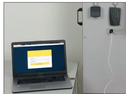
Keypad setup via supplied software