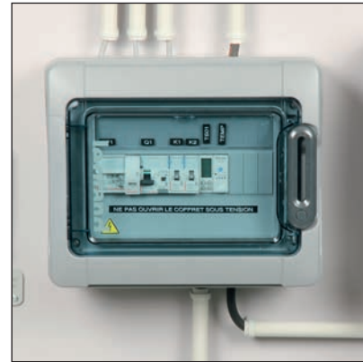
Modular electrical panel