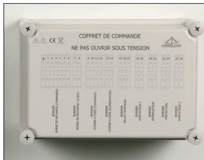
Control and components wiring for BORNELEC1-M (back panel)