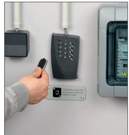
Code keypad with RFID badges provided. Remote socket for PC connection for keyboard programming