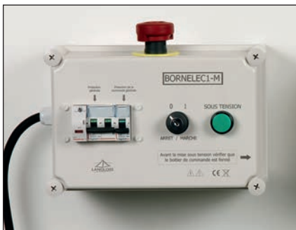
Power supply (back panel)