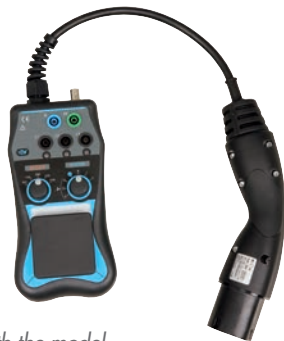
Charging station tester delivered with the model.