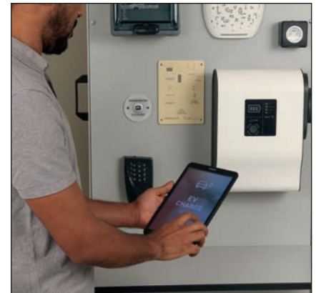
The charging station communicates via Wifi or Bluetooth. The locally created wifi network is specific to the model. It is isolated from the WiFi network of your building.