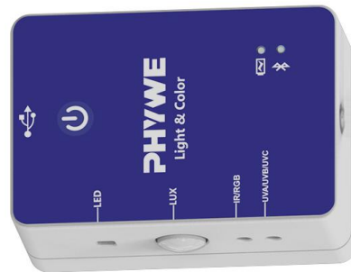
Fig. 1: 12951-00 Cobra SMARTsense Light & Color