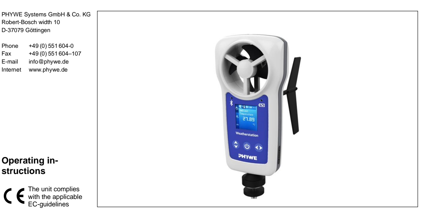
Fig. 1: 12946-00 Cobra SMARTsense Weatherstation