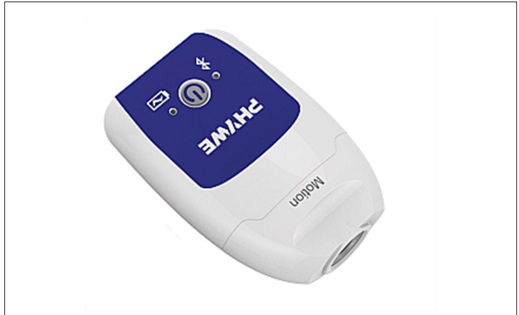
Fig. 1: 12908-01 Cobra SMARTsense Motion