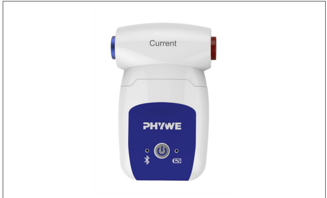
Fig. 1: 12902-01 Cobra SMARTsense Current \pm 1 A