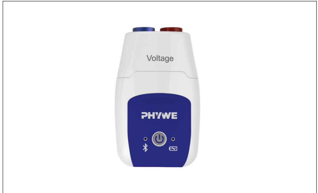
Fig. 1: 12901-01 Cobra SMARTsense Voltage \pm 30V