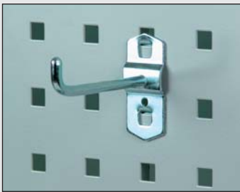
Tool holder hook (length 75mm)