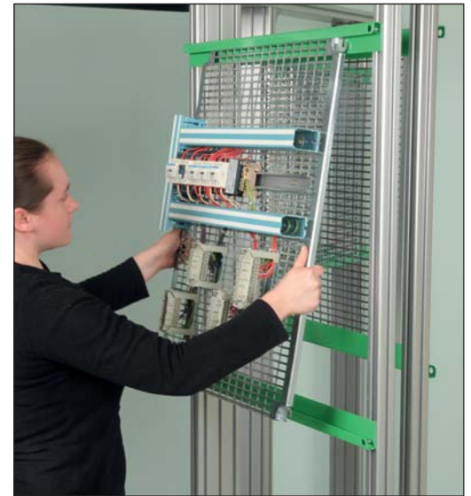
Système de fixation rapide des grilles.