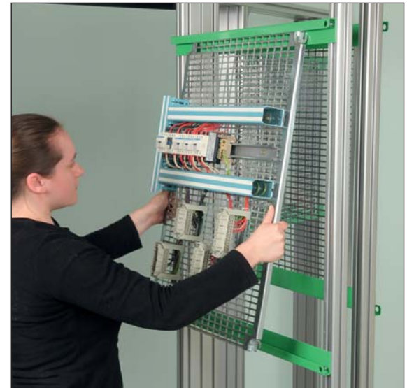
Quick fixing system supports.