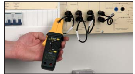
Measurement with a clamp